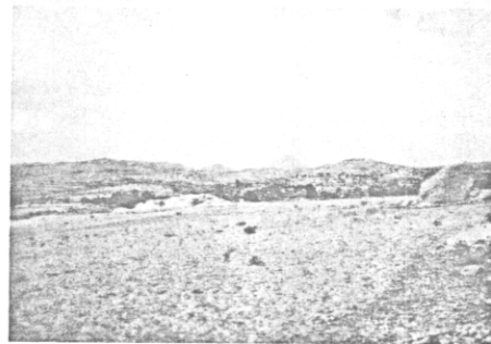
FIG. 3. WEATHERED ROCK AND SOIL ERODED AREA PHOTOGRAPHED DURING FIELD CHECK.