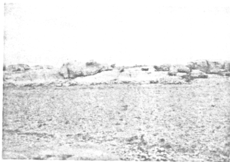
FIG. 2. WEATHERED ROCK AND SOIL ERODED AREA PHOTOGRAPHED DURING FIELD CHECK.