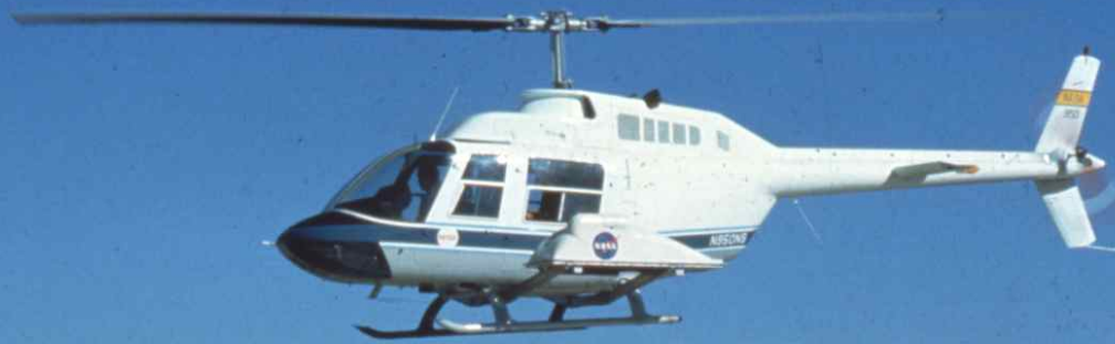
420-001: NASA Helicopter FSS viewing reflectance calibration panel