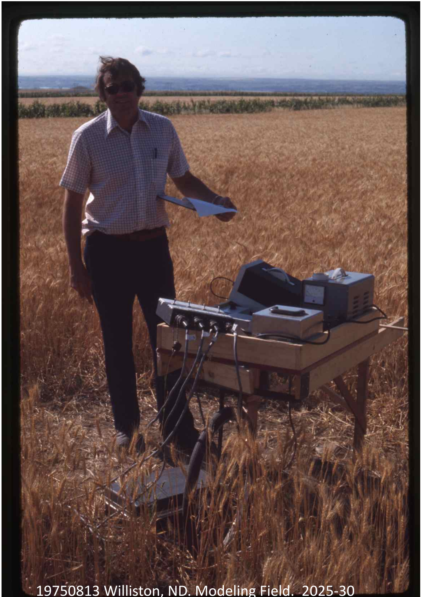
19750813 Williston, ND. Modeling Field. 2025-30