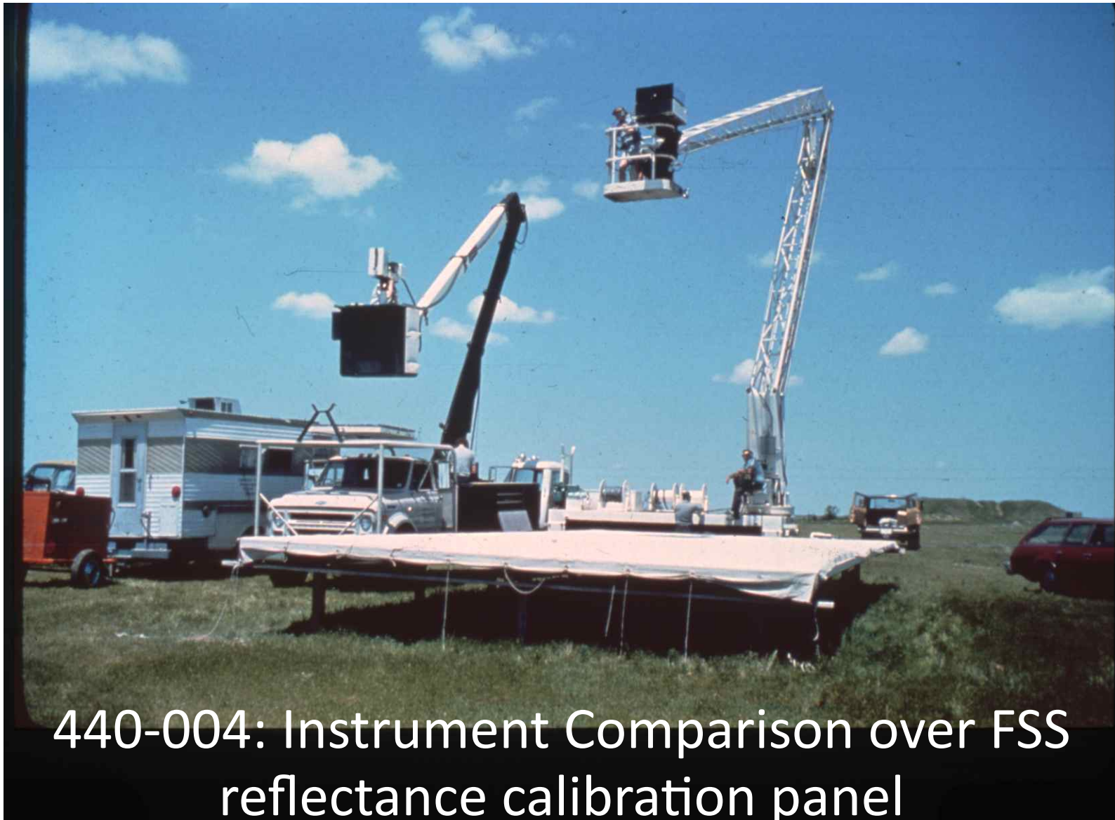
440-004: Instrument Comparison over FSS reflectance calibration panel