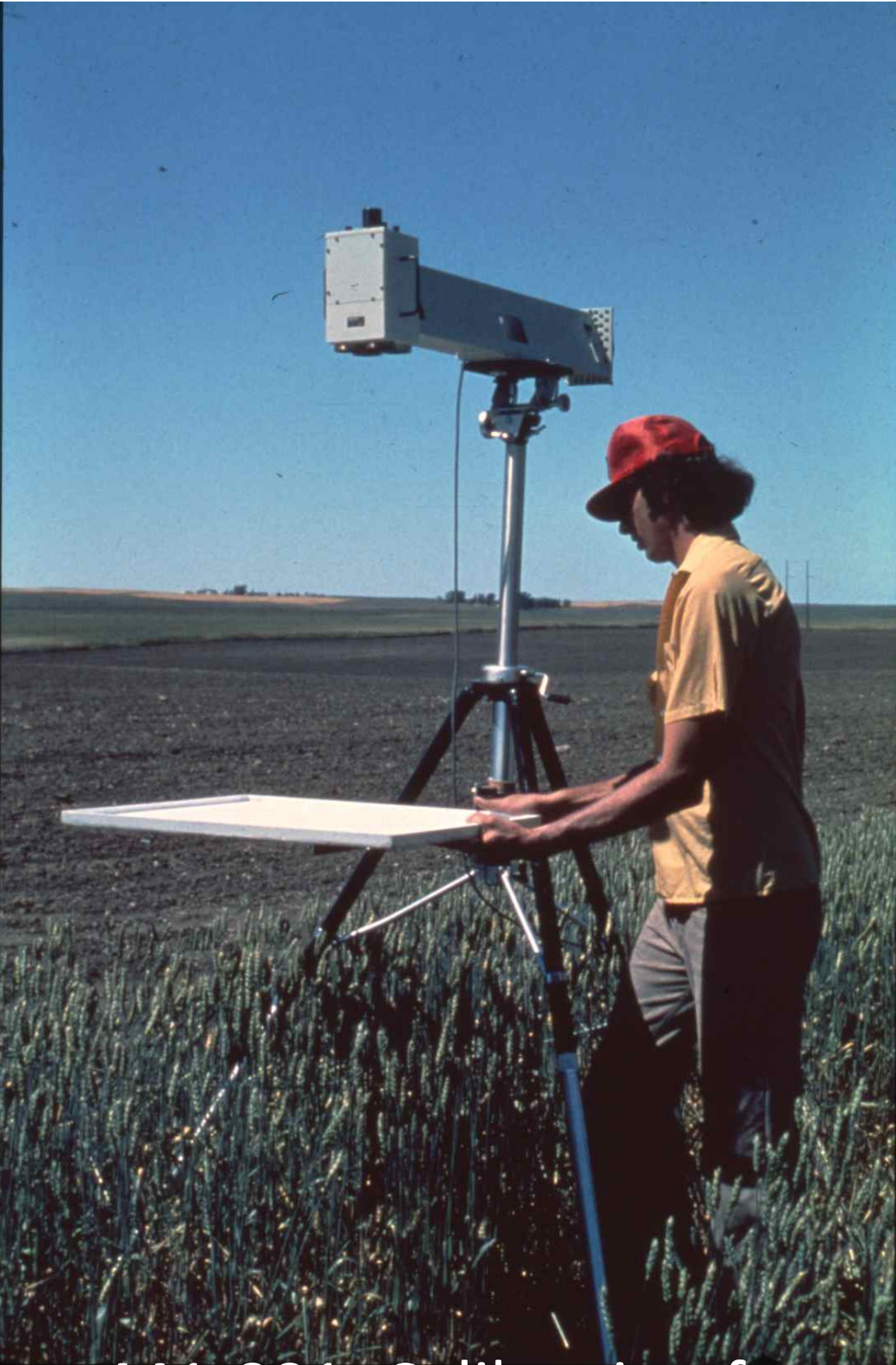
441-001: Calibration for Exotech 100 mounted on tripod