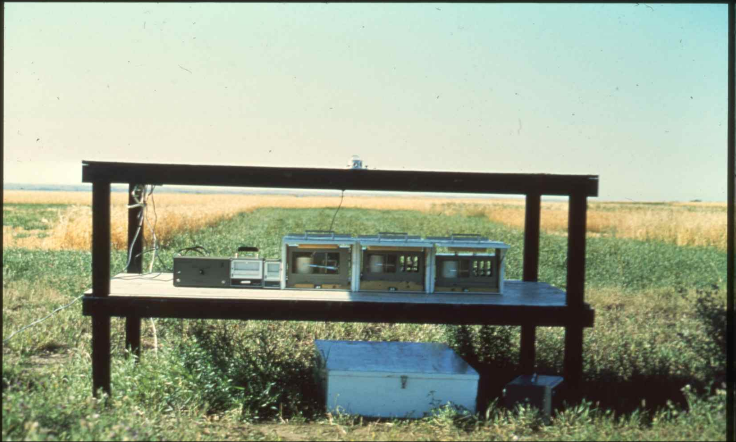
450-001: Weather station at Williston, ND Agriculture Experiment Station