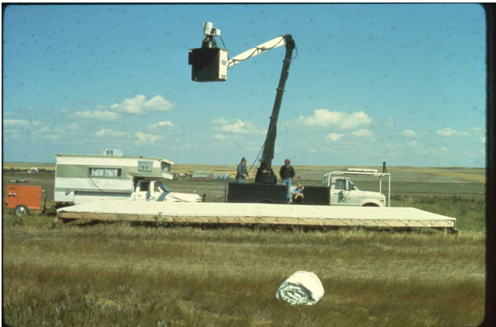
430-004: Measuring Reflectance of FSS Calibration Panel