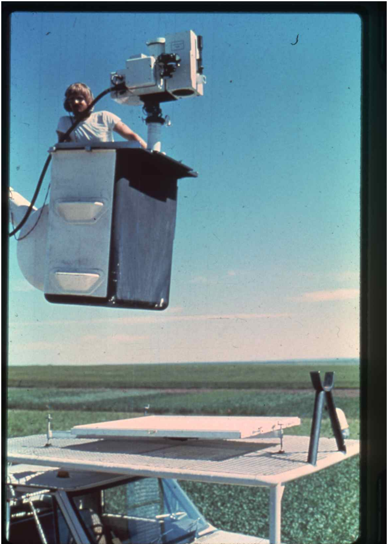
430-005: Measurement of reflectance calibration panel