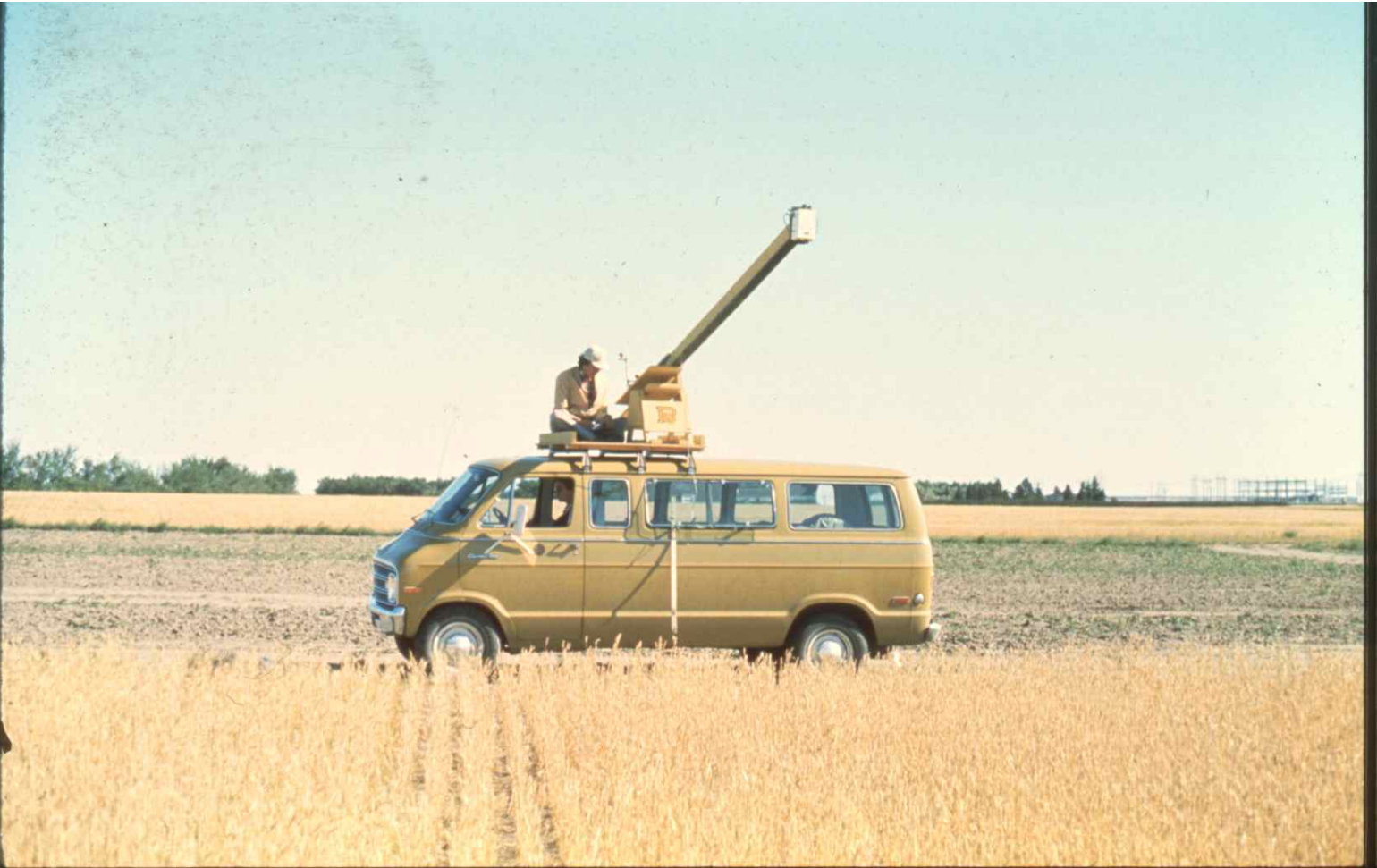
441-004: Exotech 100 on mobile platform over plots