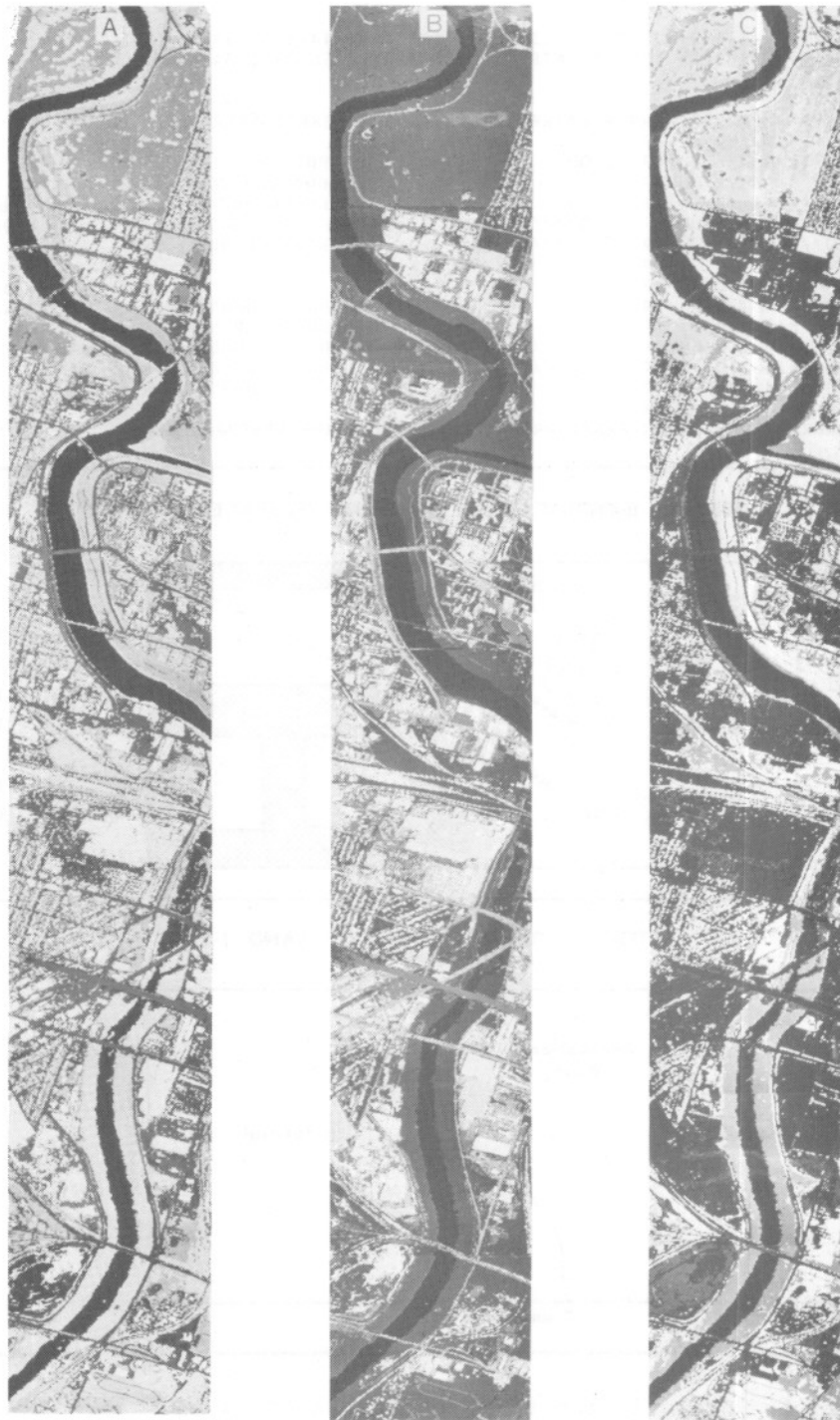
Figure 3. Photomosaics of the Land Use Classification, Photographed from IBM Digital Display. The image in A shows the general classes of earth surface features, B emphasizes the cultural features, and C emphasizes the natural features. For the exact brightness levels used for each feature in each photomosaic, see Table 3.