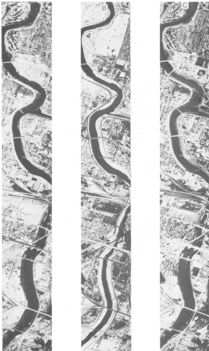
Figure 2. Photomosaics of Grayscale, Single-Band Imagery, Photographed from IBM Digital Display. The image in A is from the thermal infrared portion of the spectrum (Band 12, 9.8-11.7 \mu m), B is from the reflective infrared (Band 10, 1.0-1.4 \mu m), and C is from the visible (Band 6, .55-.60 \mu m).