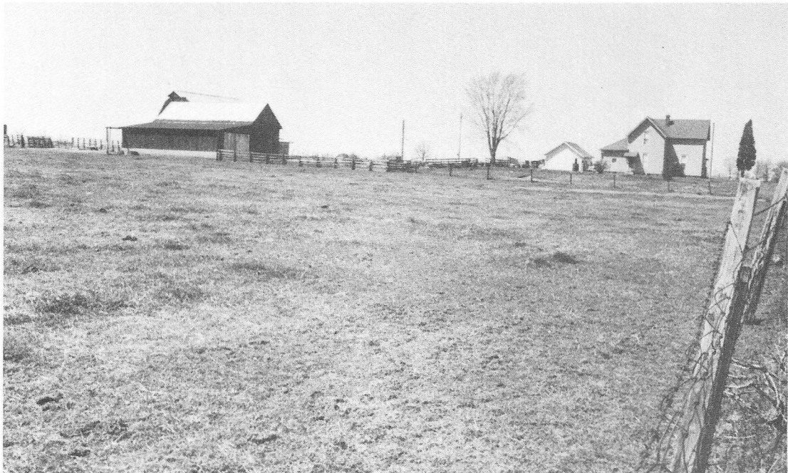
Figure 4. Homestead on Udalf Soils reflects lower productivity than found on Udoll and Aquoll soils of the adjacent Clarks Hill Valley.