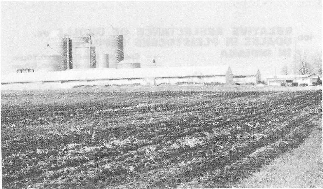
Figure 3. Homestead on Aquoll soils on surface of buried Clark Hill Valley reflects high soil productivity.