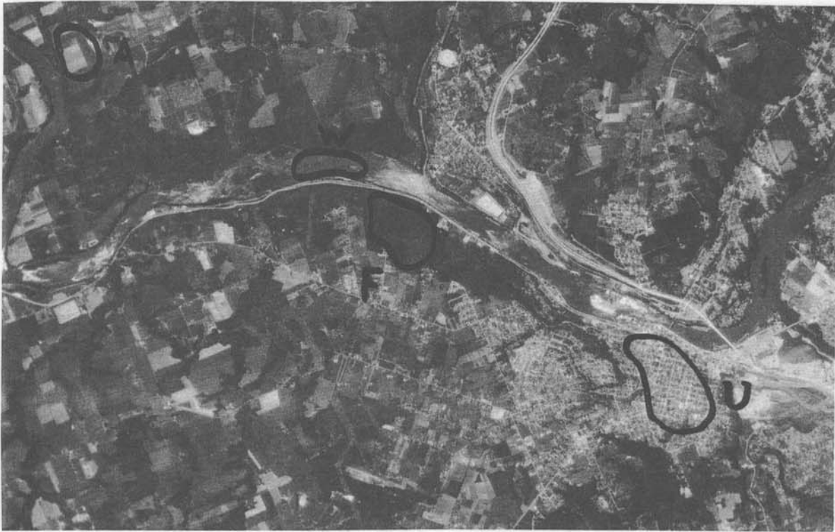
Figure 1. The source photograph for land use classification showing typical training sets and test sets.